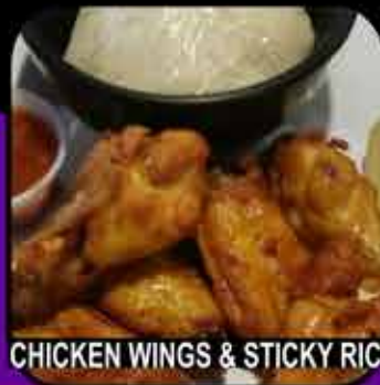
CHICKEN WINGS & STICKY RICE