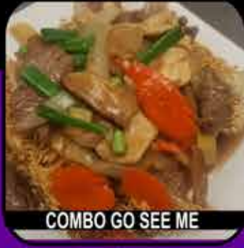
COMBO GO SEE ME