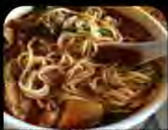
SPICY BEEF NOODLE SOUP