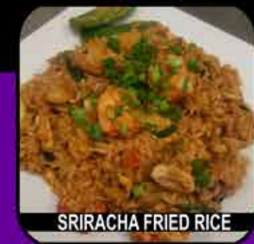
SRIRACHA FRIED RICE