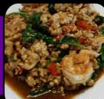
SPICY GROUND CHICKEN KRA PAO w/ SHRIMP