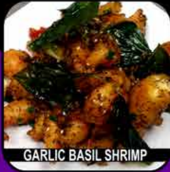
GARLIC BASIL SHRIMP