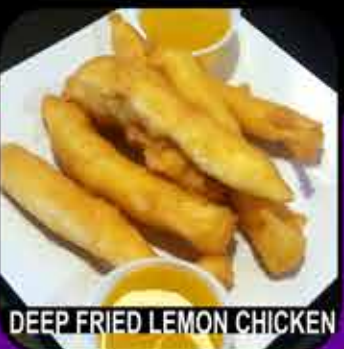
DEEP FRIED LEMON CHICKEN