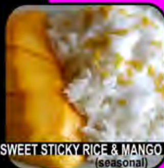
SWEET STICKY RICE & MANGO (seasonal)