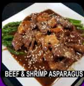
BEEF & SHRIMP ASPARAGUS