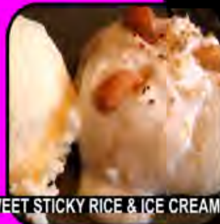
SWEET STICKY RICE & ICE CREAM