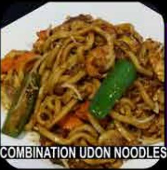
COMBINATION UDON NOODLES