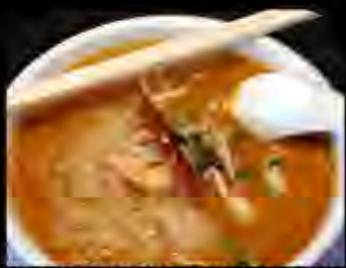
SPICY TOOM YUM NOODLE SOUP