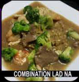
COMBINATION LAD NA