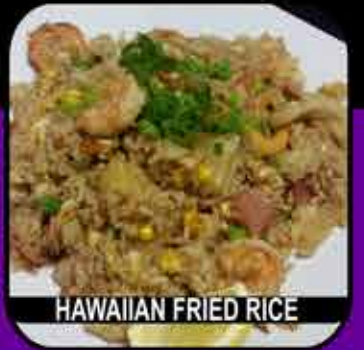
HAWAIIAN FRIED RICE