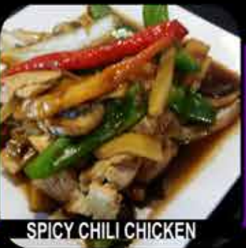
SPICY CHILI CHICKEN