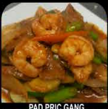
PAD PRIC GANG